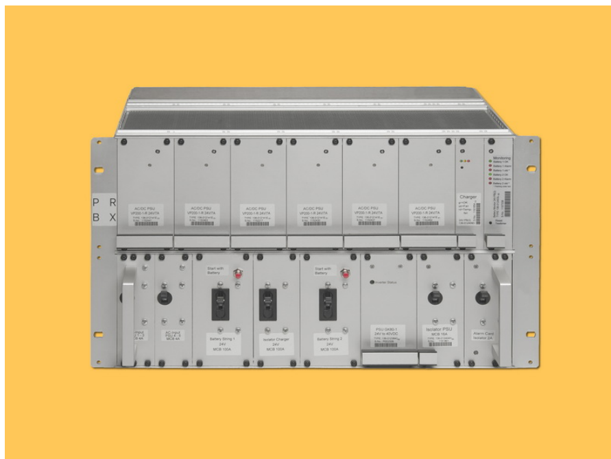
PRBX Battery Backup Unit System for railway track side signaling