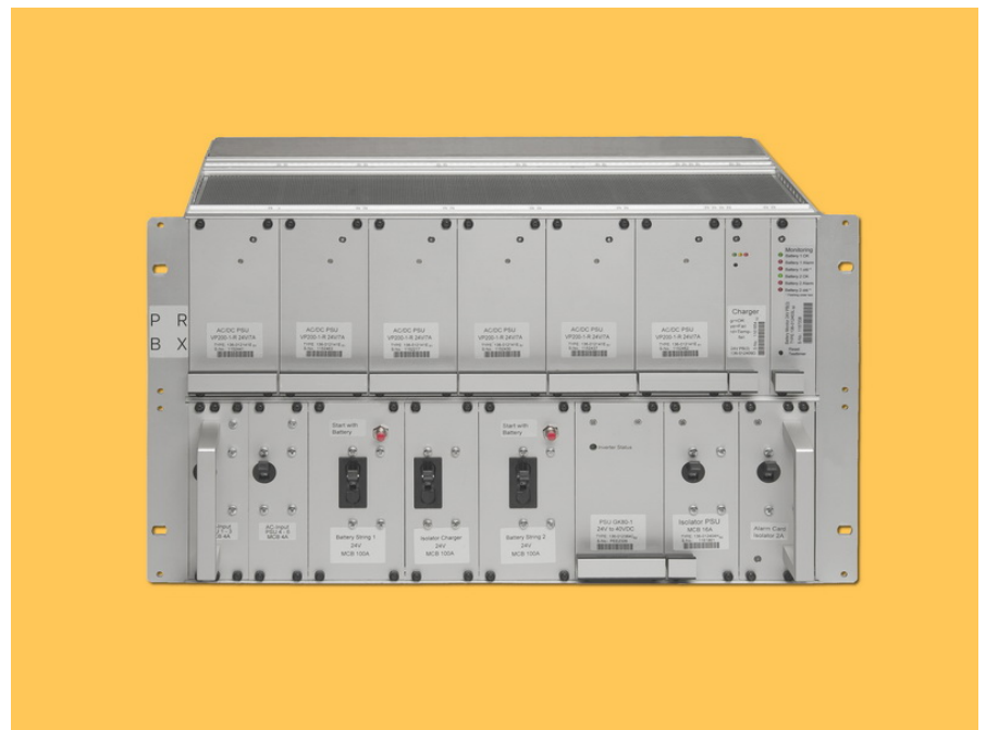
PRBX Battery Backup Unit System for railway track side signaling