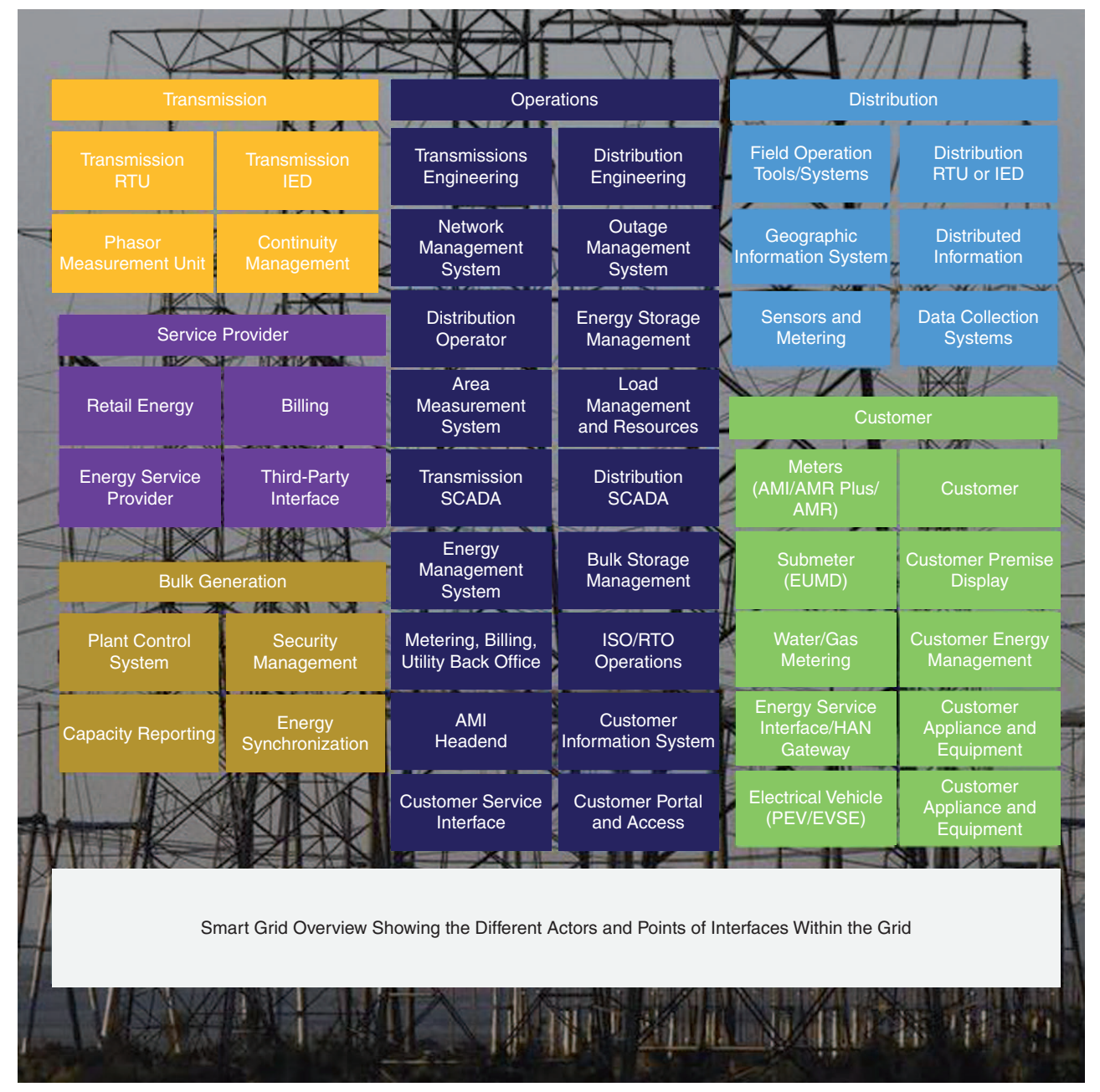
FIG 3 The complexity of the smart grid makes it very difficult to protect globally.

Although the worldwide smart grid is slowly and steadily getting stronger and safer, the potential of threats remains high.