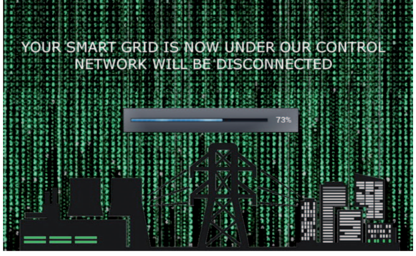
FIG 2 Cybercriminals taking control of the smart grid is now a reality.

SCADA systems are basically process control systems (PCSs) that are used for monitoring, gathering, and analyzing real-time environmental data. PCSs are designed to automate electronic systems based on a predetermined set of conditions, such as