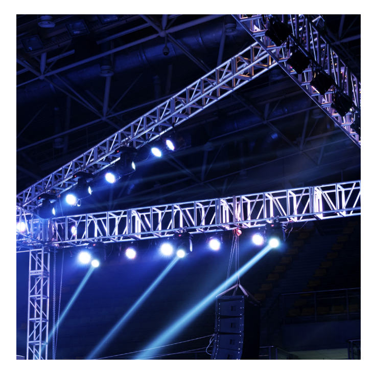
Figure 01 – Stadium and Stage LED lighting quickly deploying.

The lighting market segment is very diversified, but Solid State Lighting (SSL) based on LEDs have popped the conventional light bubble making the Edison bulb effectively obsolete and they are now infringing on fluorescent lighting. as well. The possibilities offered by SSL are also bringing lighting advantages in industrial applications such as for roads and parking lots, stadiums and stages (Figure 01), urban farming, horticulture, water purification, and medical lighting and light therapy.