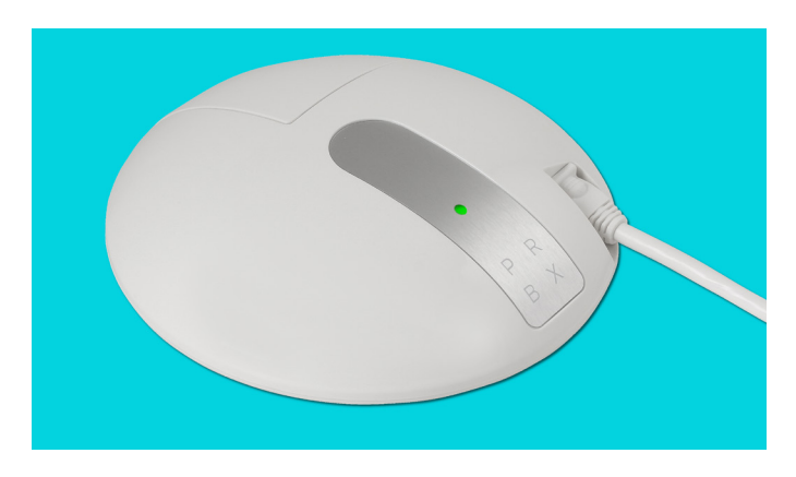
Figure 04 – Powerbox EXM2205 – Medical certified lenticular shape external power supply for home healthcare applications.

For power supplies designers the medical segment is probably one of the most demanding in terms of combined knowledge. Be a good power electronic designer is not enough anymore and it's a real team work combining many disciplines that must work together, which makes the job very interesting with full of rich learning.