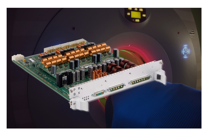
Figure 02 – Powerbox GB350 digitally controlled power supply for demanding applications operated under high electromagnetic field

From 1.2 billion USD in 2016, the global market for medical power supplies is expected to expand at a