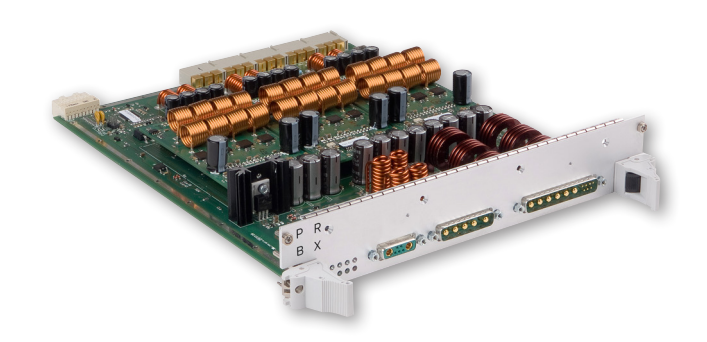
Figure 01 – Powerbox GB350 digitally controlled power supply for demanding applications operated under high electromagnetic field.

It is for sure the market for such type of product is limited to medical, researches of very specific industrial applications involving extreme magnetic fields but reflecting the level of technology and innovation required by the demanding industries. This is what makes our lives so exciting!