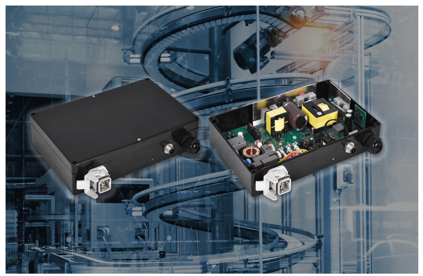
Figure 03 - PRBX Smart Power supply digitally controlled by microprocessor and built in storage capacitor for peak load and backward energy.

In all of those steps the power supply forms part of the eco-system and communication links with the HPC. Of course we are talking about power systems that are much more complex than the stand-alone versions that we have been used to in the past. But factory automation designers are expecting power supply manufacturers to not only think out of the box, but to make it possible for them to be part of the machine-to-machine network.