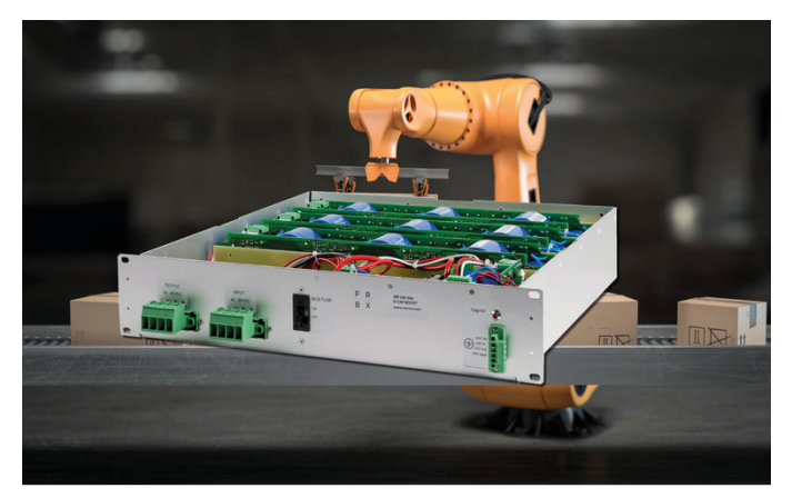
Figure 01 – PRBX S-CAP BOOST supercapacitors bank with digital control and communication interface able to deliver peak energy to load and to store backward energy.

Combining the benefits of digital control and supercapacitors make it possible to develop very advanced power systems (Figure 01), able to dynamically manage peak energy demands, reducing the impact on the grid as well as guaranteeing a longer life time for strategic components and industrial equipment. By having the ability to store regenerative energy this is also a very important contributor towards reducing energy consumption.