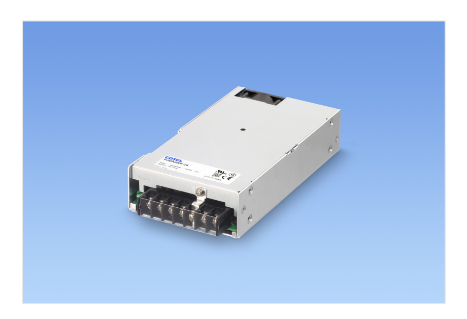
The 300W PJMA300F have a universal input range of 85 to 264VAC and comply with international safety standards.