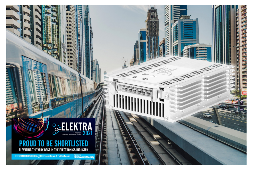
Powerbox ENR500D high efficiency 750V DC/DC converter for light-rail and industrial applications

Designed specifically for railway applications, the ENR500D fulfils the aforementioned stringent EN 50124-1 standard and delivers full performance across the temperature range of -40 to +70 degrees C. It is also meets the requirements of the so-called Pollution Degree 2 (PD2) such as control cabinets in the driver's cabin or passenger compartments.