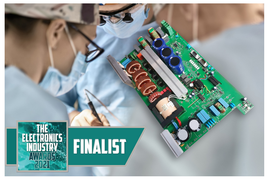
Picture: Picture source: PRBX / mydegage / Shutterstock PRBX SMM3000A80024C high peak load power supply for medical laser applications

The SMM3000A80024C also delivers an auxiliary output voltage of 24VDC, reducing the need for an additional power supply to power laser controller and interfaces. For additional power, the SMM3000A80024C can be connected in parallel.