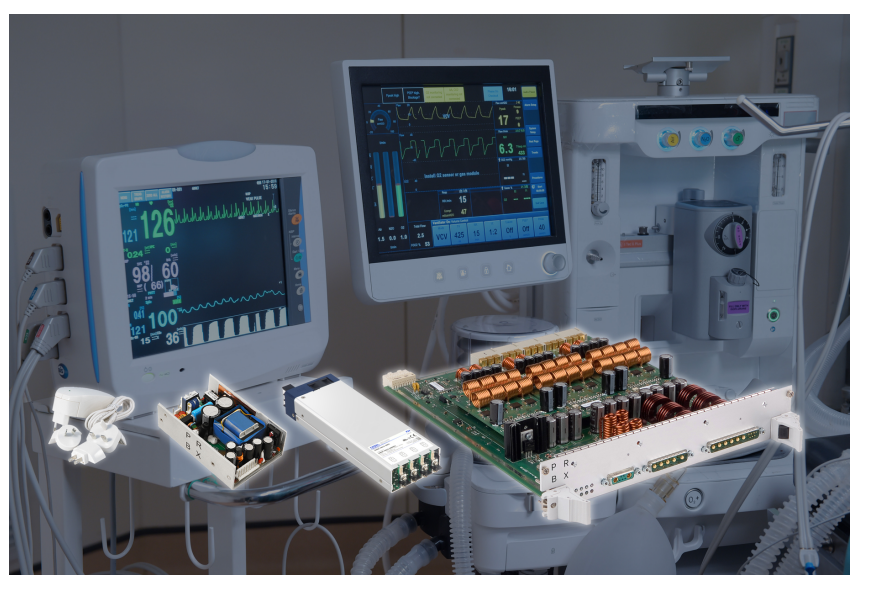
From external adapters to fully customized units, PRBX and COSEL provide power solutions for demanding medical applications.

By working together, we will all get through this together.