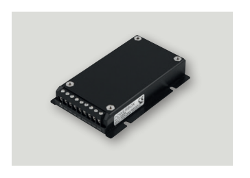
PAF150(D)150 Series 150W, 24V, 48V or 110V input DC/DC converter