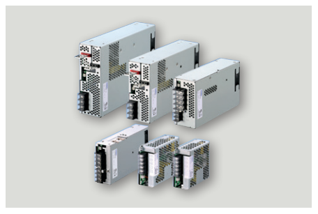
Enclosed 10W - 10KW