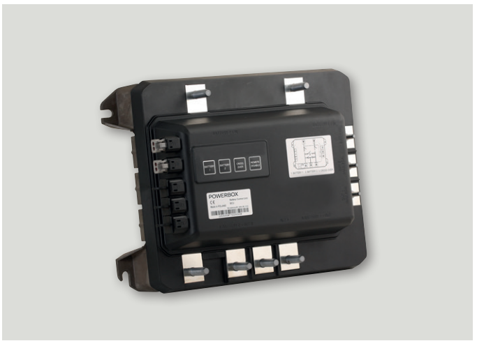
Diesel battery control unit, including battery switch controller (300A continuous, 600A peak) with load balancing. The unit includes remote control and design to comply with engine compartment requirements.