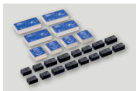
Low power series 1.5W – 80W