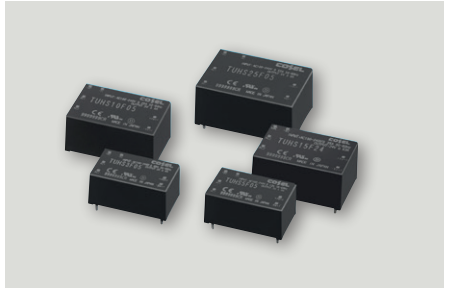
PCB AC/DC 3W - 25W