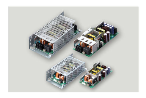
Open Frame 10W – 300W