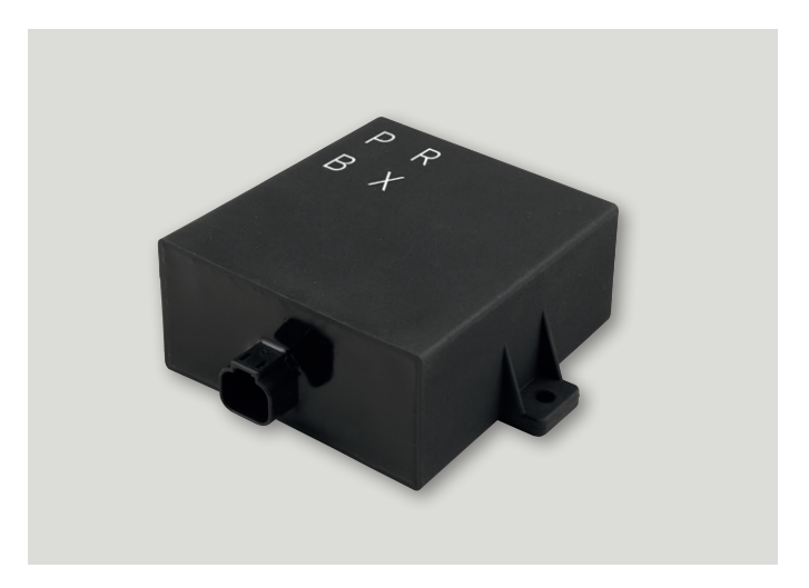
Rugged DC/DC Booster for diesels engine delivering constant voltage to the engine monitoring system during startup. The unit generates boosted voltage to compensate lower battery voltage during the ignition phase.