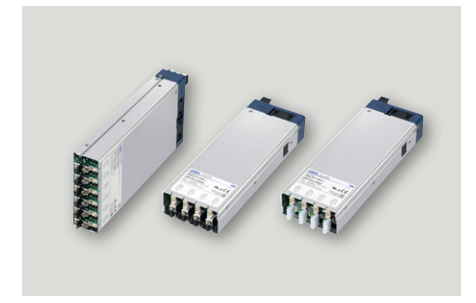
Configurable 300W – 1200W