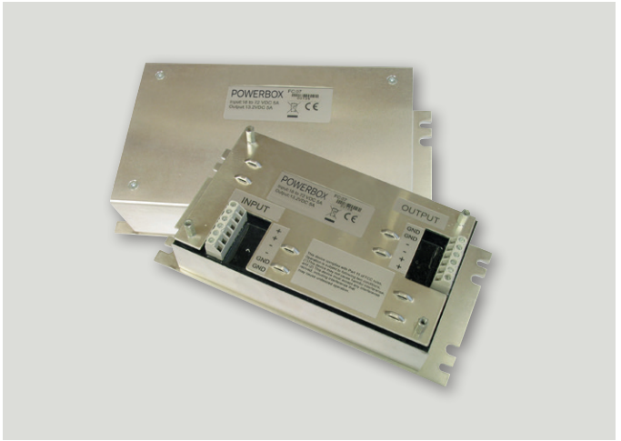
Ruggedized 60W DC/DC power supply for powering PC systems in automotive applications.