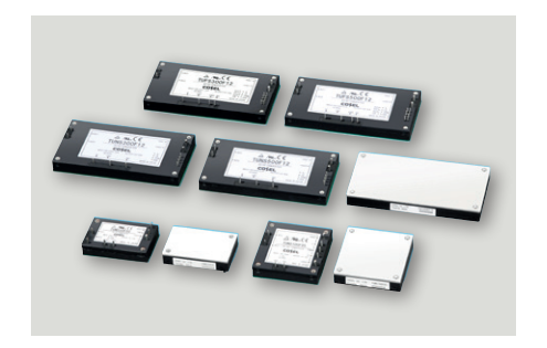
PCB Power Modules 50W-1200W